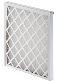
RedPleat Coarse 70%