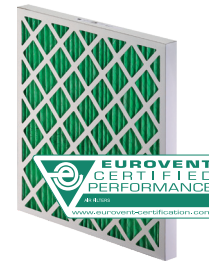
RedPleat ePM10 70%

RedPleat HT are designed for use in high temperature applications up to 260 °C.